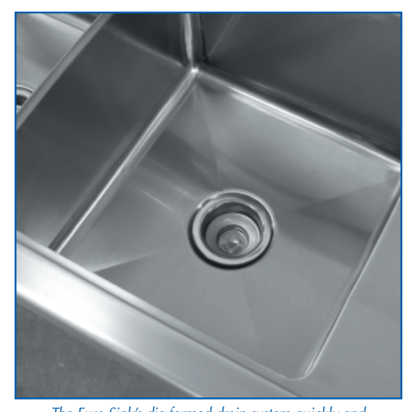
The Euro Sink's die formed drain system quickly and completely empties the sink bowl.